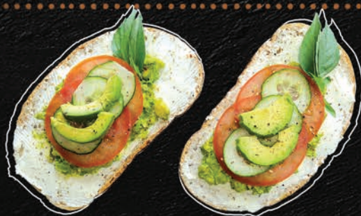
CLASSIS AVOCADO TOAST $13.99

PHILADELPHIA CHEESE, AVOCADO OIL, TOMATOES, CUCUMBER, TOASTED BREAD