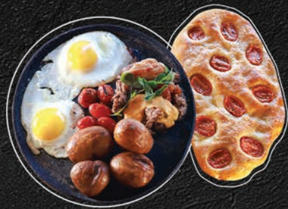
MEXICO CITY $23.99

2 FRIED EGG, ROAST BEEF, TOMATO, POTATO, SALSA SAUCE, SOUR CREAM, CHEESE SAUCE, SIDE OF BREAD