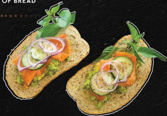
AVOCADO & SMOKED SALMON $17.99

PHILADELPHIA CHEESE, AVOCADO OIL, TOMATOES, CUCUMBER, TOASTED BREAD